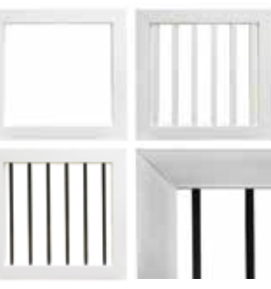
Custom Welded Gates