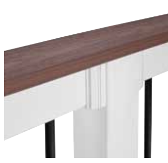
Traditional (Available in double aluminum and 42")