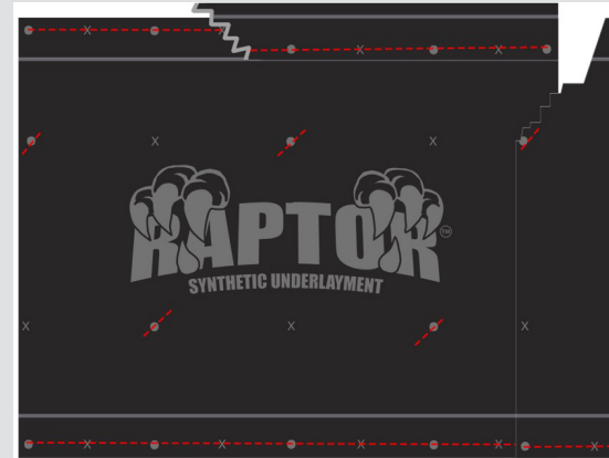
Stapling Pattern For Raptor Use as few staples as possible. Raptor installed with staples must be covered with shingles the same day.