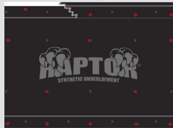
Nailing Pattern For Raptor In Normal Conditions Using Regular Roofing Nails or Cap Nails